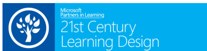
Figure 1: 21 CLD Certification Badge

The College has invested in the development of several staff members who are now certified in the 21 CLD Framework and is championing the process of embedding the framework across the curriculum, in line with the 1-to-1 (1:1) implementation strategy.